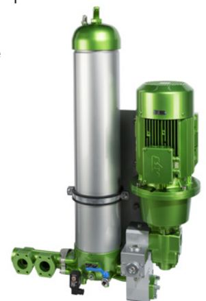
FG Filter Module Pi 83116